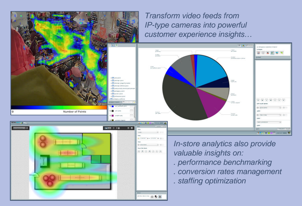
Take fast actions to achieve financial improvements

The software measures and converts traffic, dwell time & engagement statistics into detailed business intelligence reports allowing the comparison of different stores in real time for fast coordinated actions.